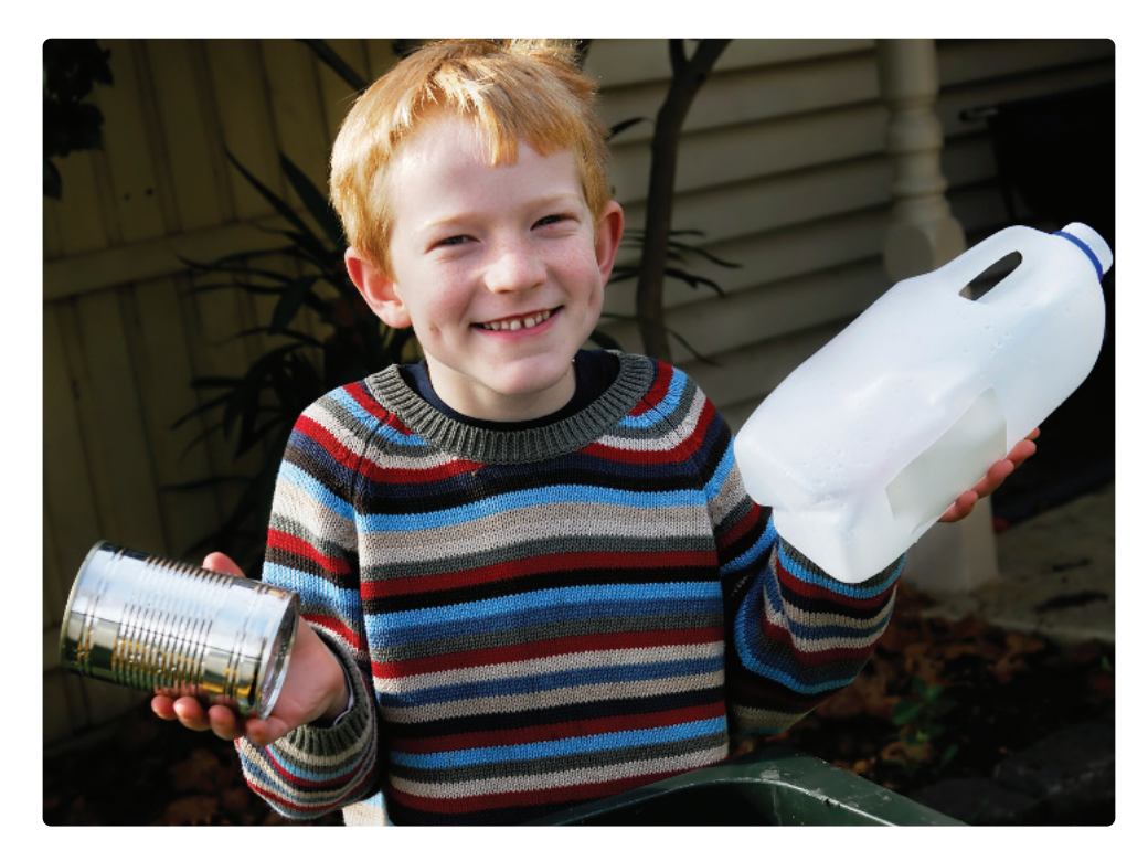
Save Energy, Money and the Environment

Recycling is now easier than ever, with most homes benefitting from a recycling service through their local council. For more information on what you can recycle contact your local council, details are provided on Pages 26 to 27.